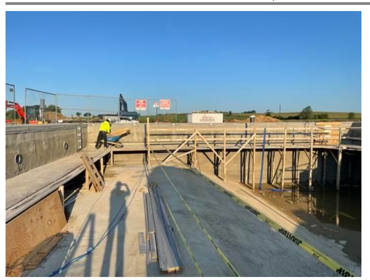
Prepare for top pool finishes Taken on Aug 16, 2023, 7:20 AM CDT Added on Aug 16, 2023, 7:41 AM CDT Added by andrew gordon