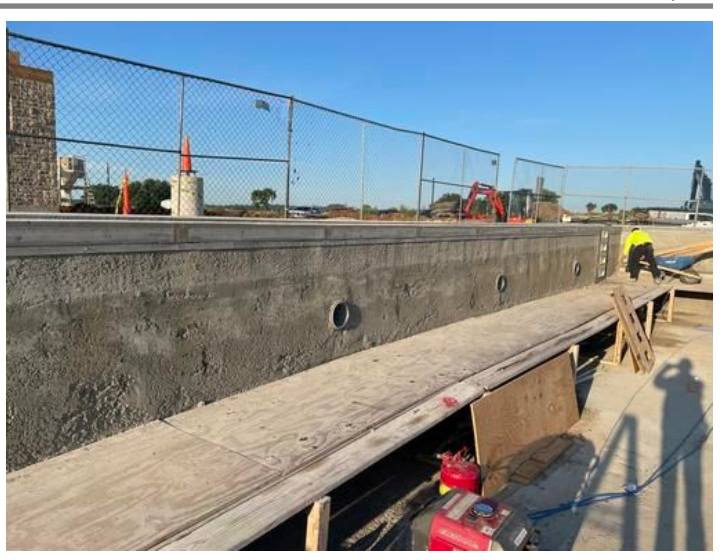
Prepare for top pool finishes Taken on Aug 16, 2023, 7:20 AM CDT Added on Aug 16, 2023, 7:43 AM CDT Added by andrew gordon