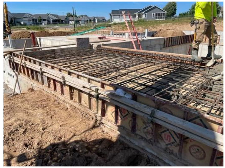
Concrete Floor pour at Equipment/pump House Taken on Aug 16, 2023, 3:42 PM CDT Added on Aug 16, 2023, 4:40 PM CDT Added by andrew gordon