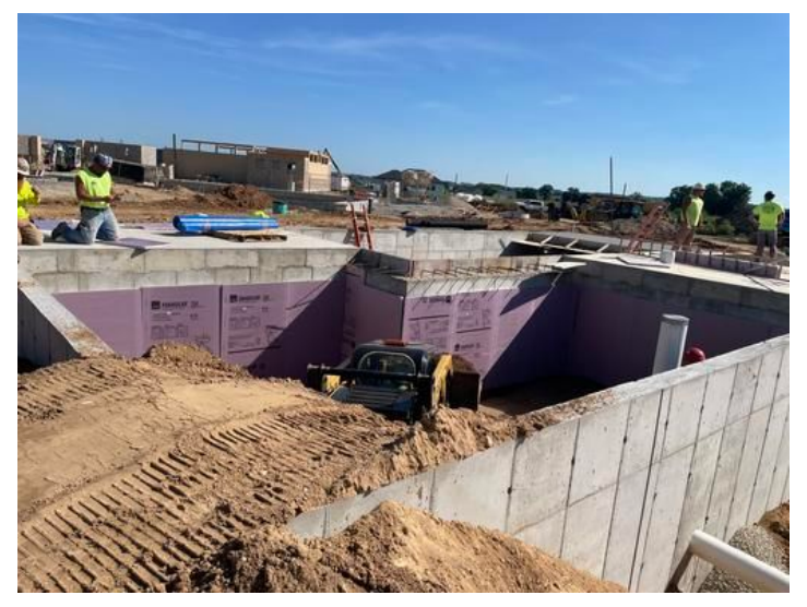
Back filling and compacting Equipment/Pump House Taken on Aug 16, 2023, 4:17 PM CDT Added on Aug 16, 2023, 4:39 PM CDT Added by andrew gordon