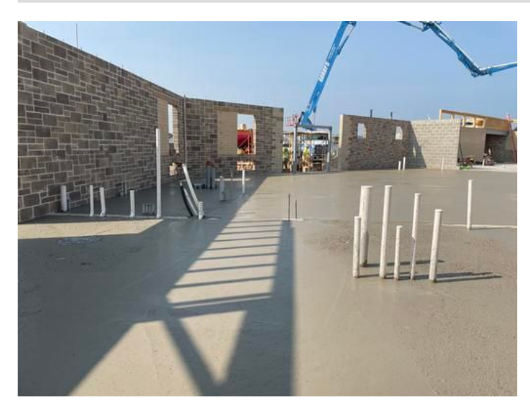
Concrete Floor pour at Bath House Taken on Aug 18, 2023, 10:04 AM CDT Added on Aug 18, 2023, 10:18 AM CDT