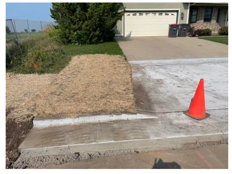
Repared of homeowners yard and concrete Taken on Aug 18, 2023, 9:57 AM CDT Added on Aug 18, 2023, 10:20 AM CDT